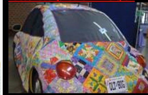
As seen at a quilt show in Port, OR